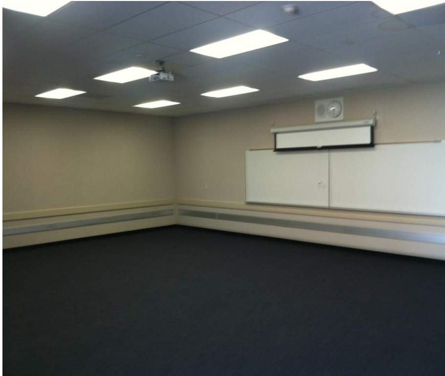
New Classroom Data Raceway, Projector, & Improved Interior Finishes