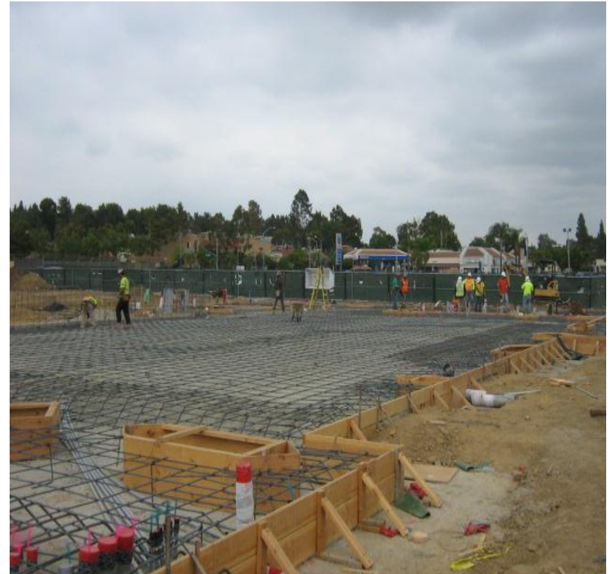
New Building "C" Slab Forms, Utilities & Rebar As of 5/22/14