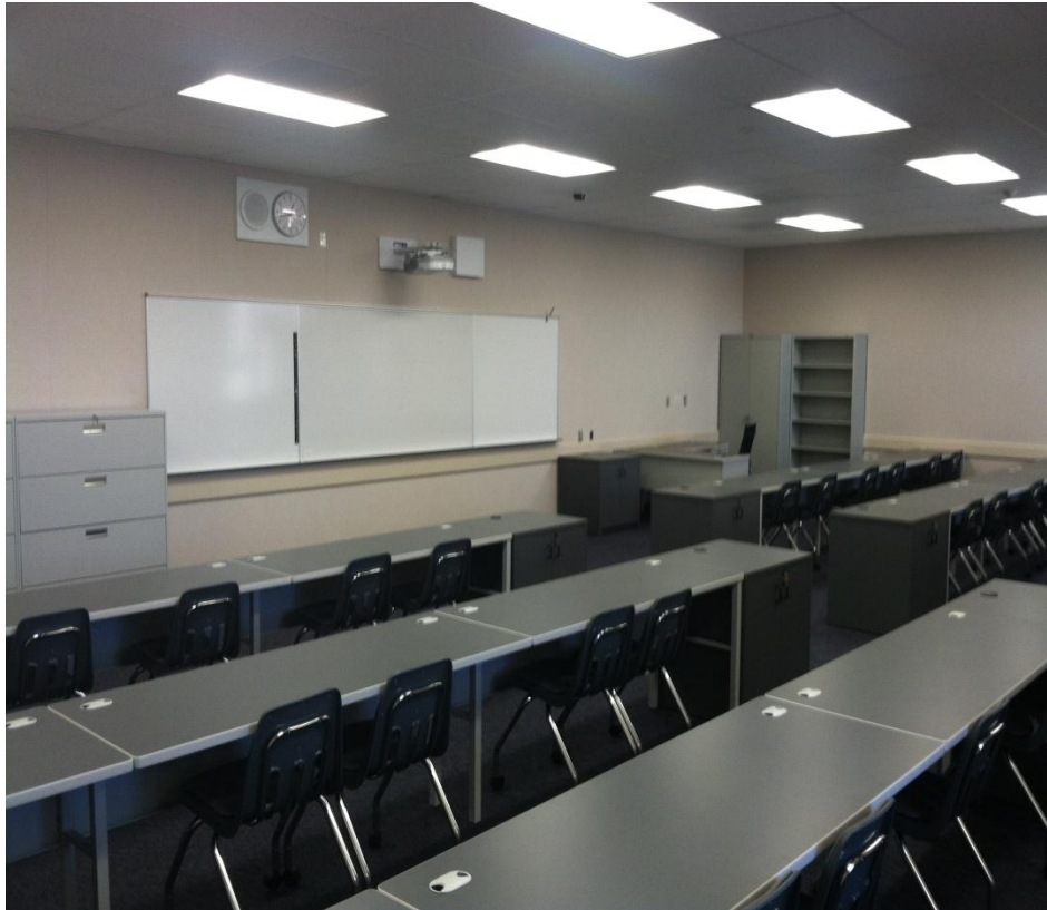
New CTE Business Classroom Smart Board, & Office Environment Furniture