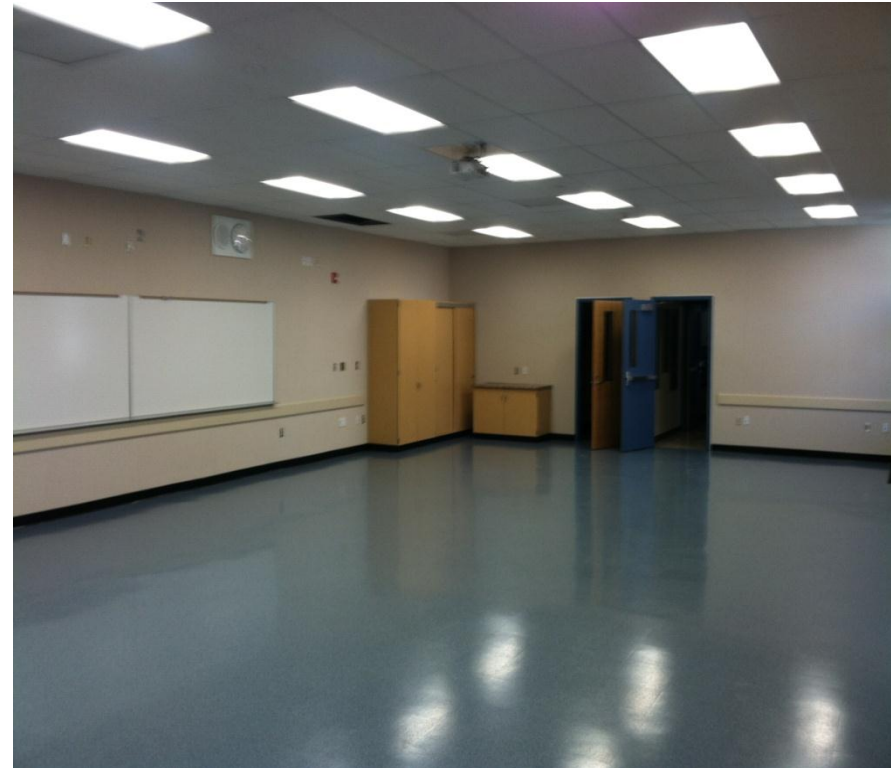
New Classroom Casework, VCT Flooring & Whiteboard