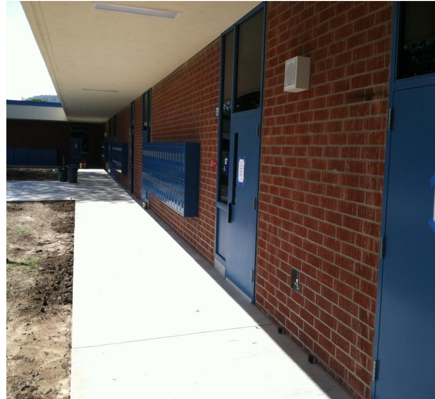
Modernized Building Exterior New Lockers, ADA Compliant Flatwork, Stucco, Paint, New Doors & Hardware