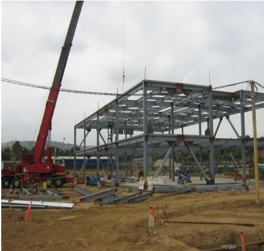
New Building "B" Structural Steel Erection As of 5/22/14