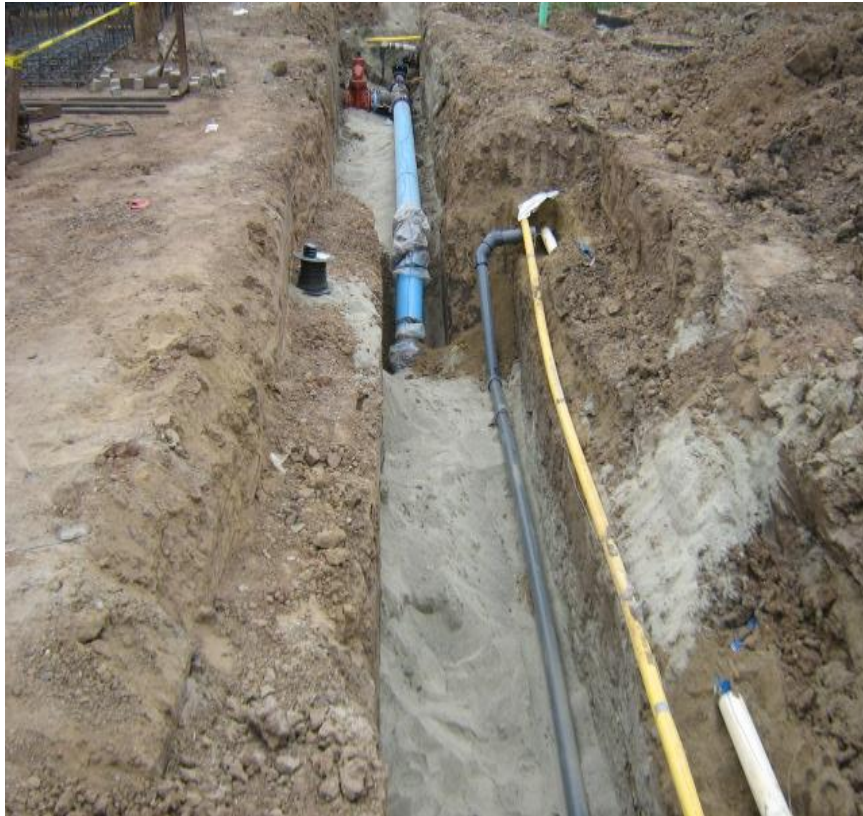
New Building "A" Gas, Sewer, & Fire Service Utilities