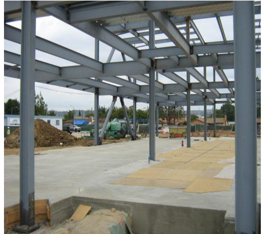
New Building "B" Slab & Steel Erection As of 5/22/14